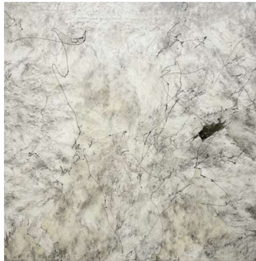
BLESSING SERIES 2-1, acrylic on canvas, 120 x 120 cm, 2010.